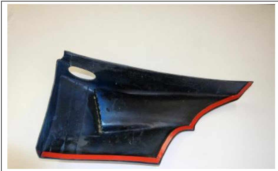
Figure #1 #1

PHASE 3) INSTALLATION OF THE ADHESIVE TAPE (perform in a warm area above 70 Degrees)